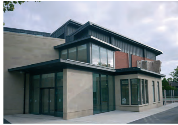
Entrance to the new £5.5 million Ian Robinson Sports Centre