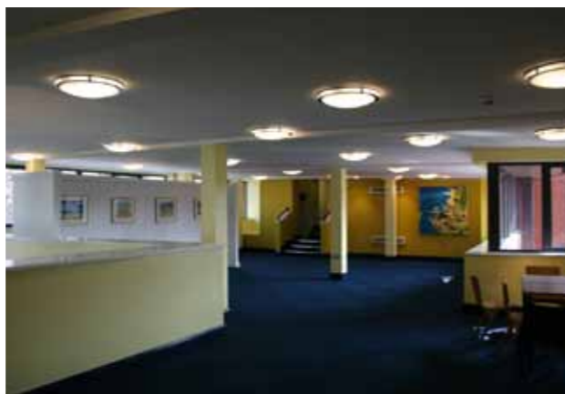
New Vitreum Art Gallery

When education is enjoyable, the girls learn more, they give more and in return achieve more. A rich and diverse programme of events are arranged on a regular basis and provide some of the highlights of school life: field trips, productions, performances, competitions, sports fixtures, educational visits, master-classes, workshops, lectures and charity events to name but a few. These activities complement the usual curriculum for Year 7 girls: English, maths, French, physics, chemistry, biology, religious studies, history, geography, classical civilisation, drama, ICT, art, technology and PE.