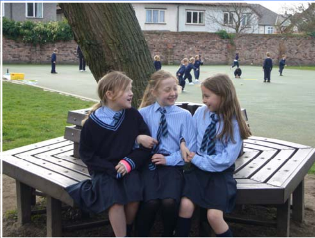
Stanfield Mixed Infants & Junior Girls