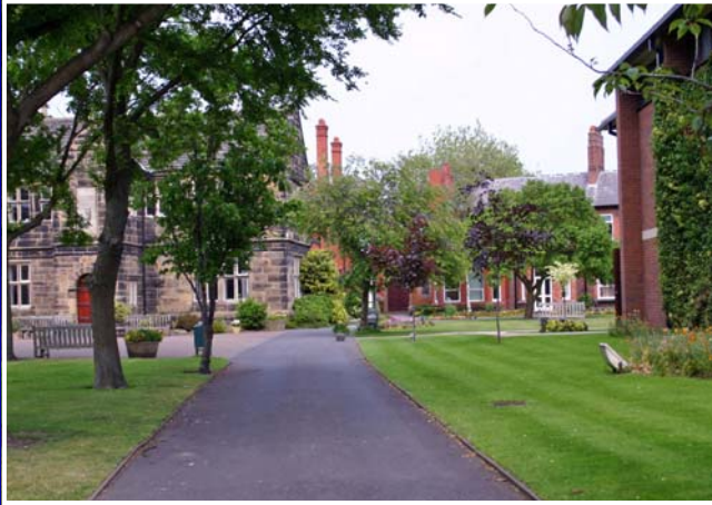
Senior Girls' School