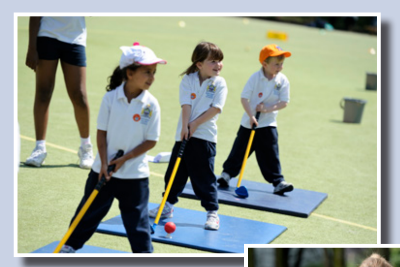
"You'll get to try lots of sports at Stanfield."